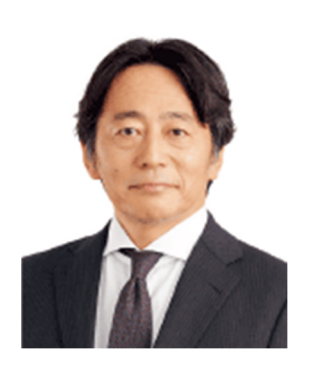
No. of Shares Owned 21,700 shares Board of Director Meeting Attendance Record 100 percent (13 of 13 meetings)