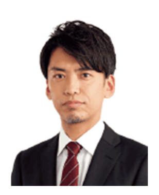
No. of Shares Owned 1,020 shares Board of Director Meeting Attendance Record